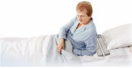
Images for illustrational purposes only Sensor should be placed underneath the bed sheet