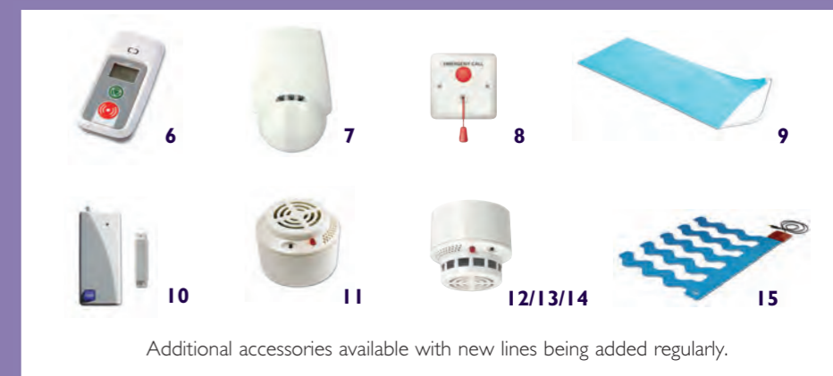
Additional accessories available with new lines being added regularly.

The lightweight and portable Info Pager is a useful way to manage the system of alarms and sensors which can be fitted in the home. It displays the last 16 alarms, with the dates and times and locations, and includes an assistance button to call another pager. It is possible to connect up to 64 types of activation to every Info Pager. Info Pager can be used in conjunction with the NEO care phone or as a stand alone system.